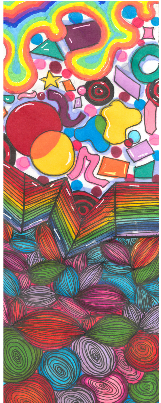
Samara Powell, Grade 9